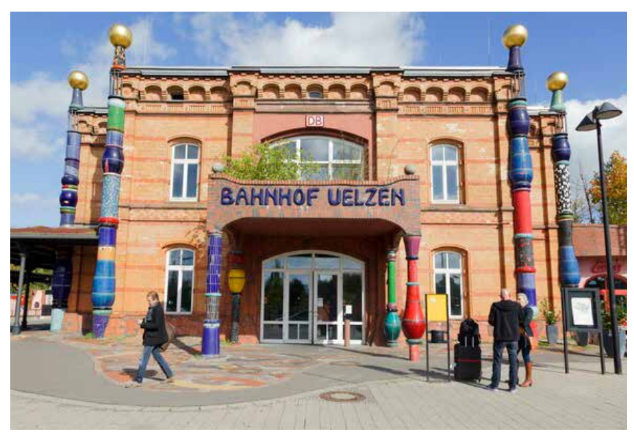
A colourful work of art: the Hundertwasser railway station in Uelzen (Lower Saxony) enchants with its shapes and vibrant colours!