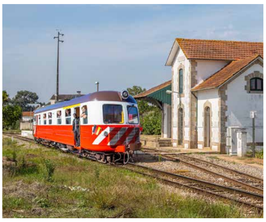
A Jewel: Together, HVLE 2022 trainees restored Nohab railcar 9103 on the Aveiro-Sernada de Vouga narrow-qauge railway in Portugal.