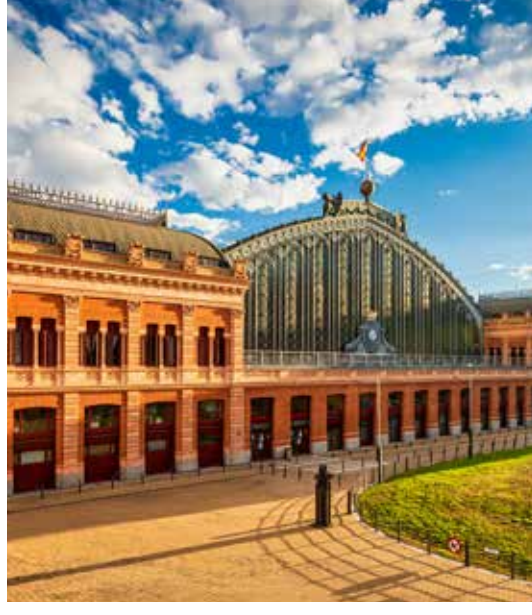
Madrid's architectural jewel: the impressive Atocha railway station.

Perhaps you will travel on to Zurich and Lausanne. Here you will visit the train station with its Art Nouveau elements and make a detour