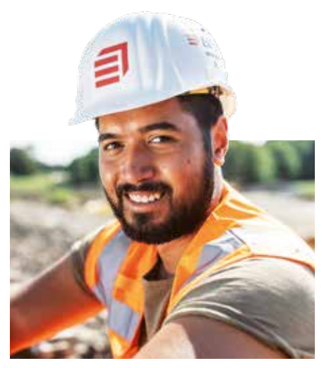
Diverse opportunities in traffic route construction for pupils, students and graduates.