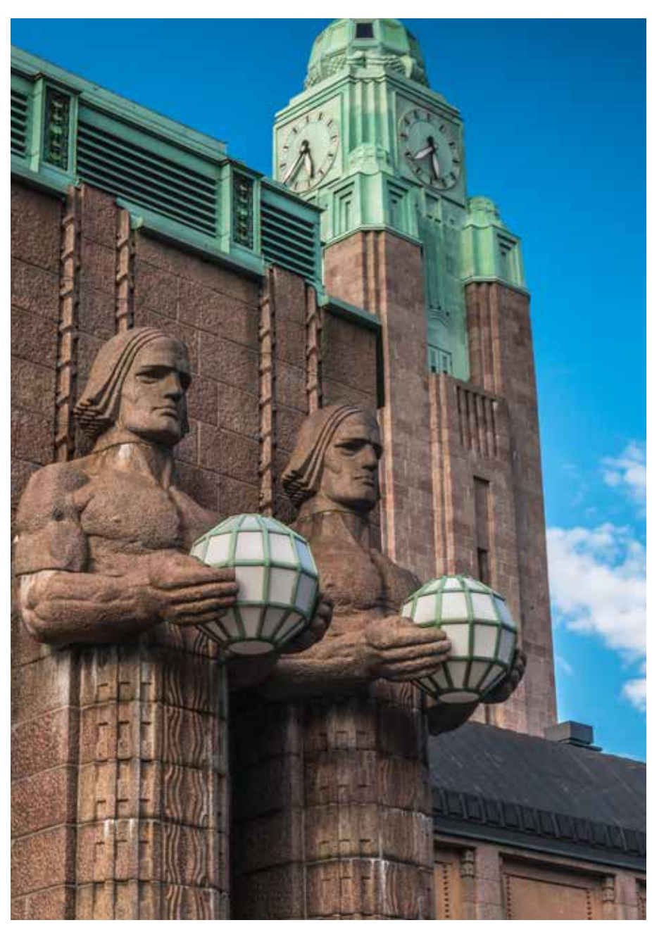
The "Lyhdynkantajat" (lantern bearers) on the façade of Helsinki's Art Nouveau main station.