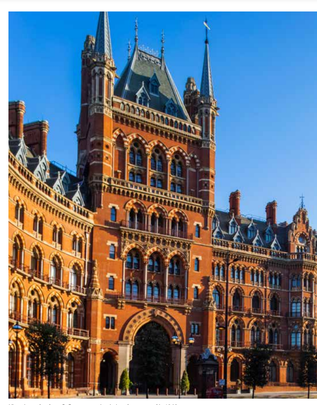
Victorian splendour: St Pancras station in London, opened in 1868.