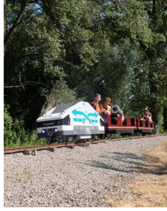
The competition vehicles combine creativity and improvisation with state-of-the-art rail vehicle technology.

Learning from mistakes is also allowed here: All systems work with low voltage. If a locomotive derails, the team can manually re-rail it.