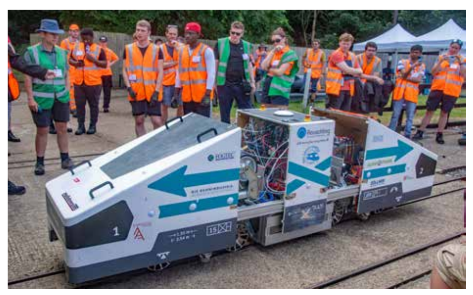
Designed by students, driven by innovation. This impressive "model locomotive" shines in international competition with its performance, reliability and energy efficiency. A look into its fascinating technology and electronics reveals the future of rail transport.

For the winning teams, it's on to Stapleford. While the European Railway Challenge was held for the first time in 2023, the IMechE Railway Challenge in Stapleford (UK) took place for the twelfth time.