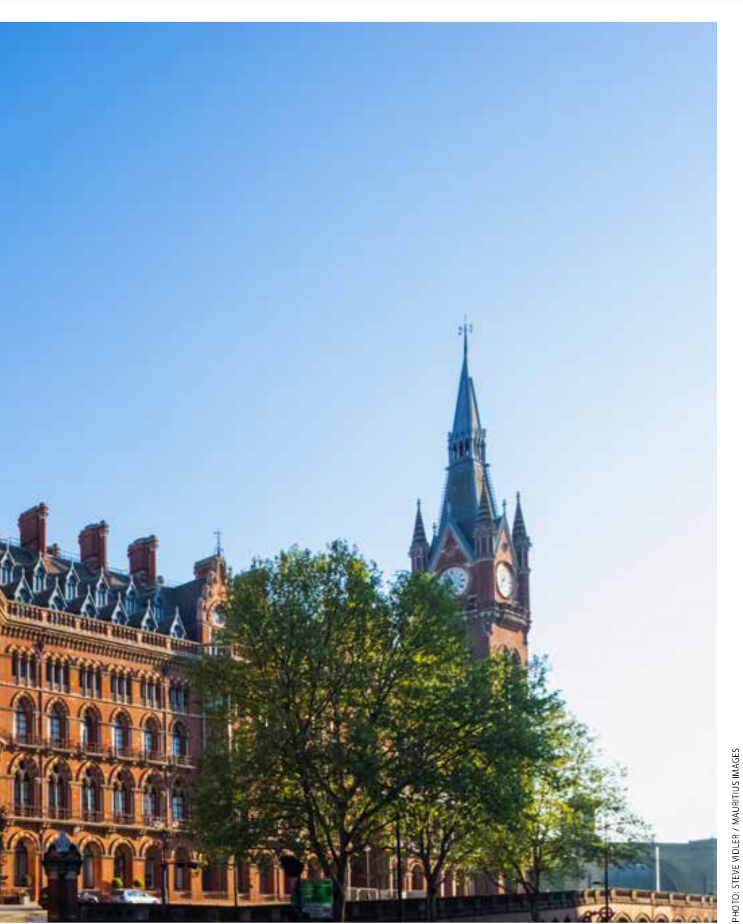
The term "Victorian" refers to the era of Queen Victoria's reign from 1837 to 1901.