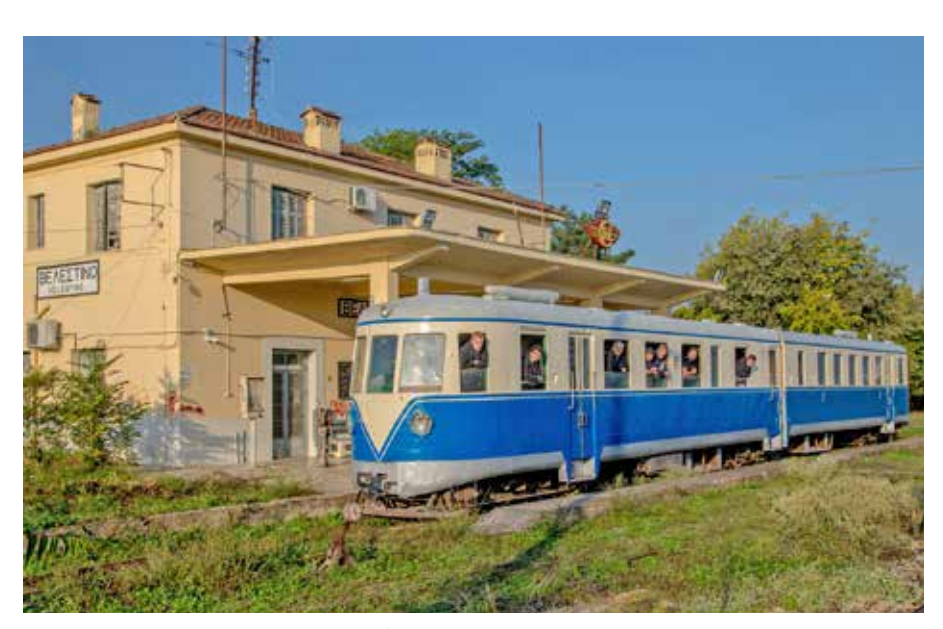
Only together is the group strong: HVLE offers its trainees the opportunity to gain new experience with an internship abroad – like here in Greece in 2021.

always have enough work – whether in Greece, Ireland or Sweden.