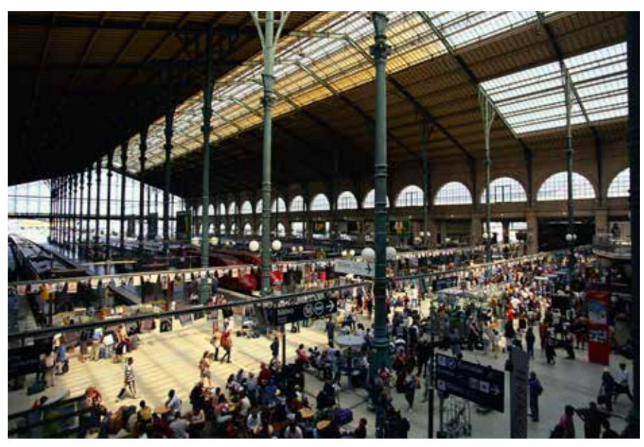
The vibrant soul of Paris: welcome to the timeless elegance of the Gare du Nord!