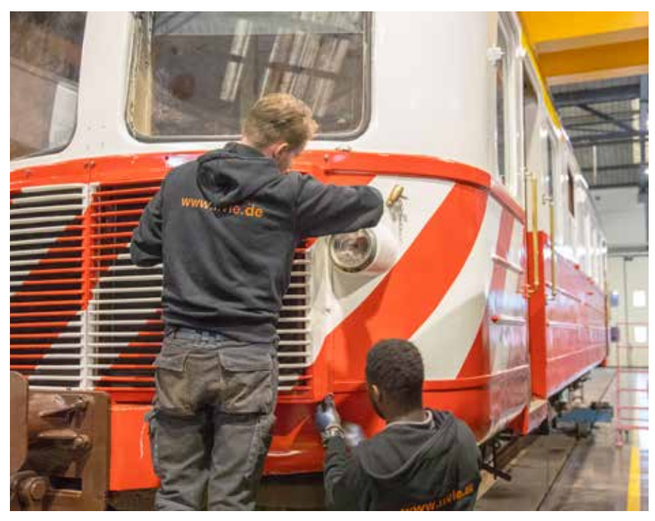
Restoring historic rail vehicles is a great pleasure – but requires a lot of commitment from the team.